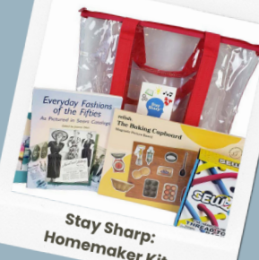
Stay Sharp: Homemaker Kit

To borrow or request these engaging, enjoyable, and literacy-building new items, please visit the library, call 717-354-0525 , or search www.elancolibrary.org .