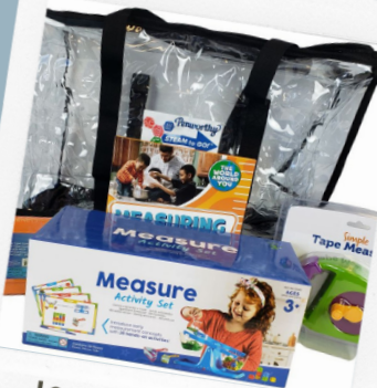
Learn to Measure Kit