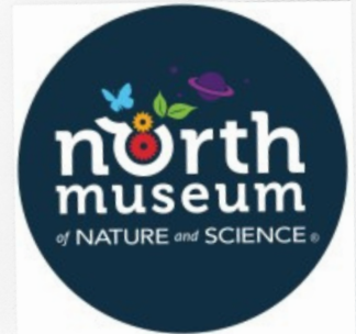
North Museum of Nature and Science Family Museum Pass