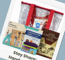
Stay Sharp: Handyman Kit