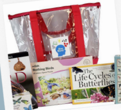
Things that Fly: Birds & Butterflies Kit