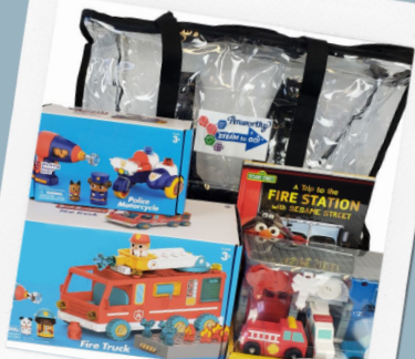
Police and Firefighter Play Kit