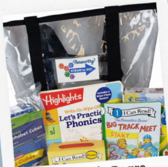
Berenstein Bears Phonics Kit