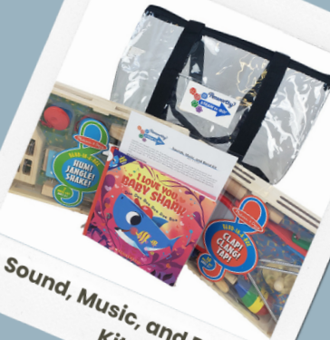
Sound, Music, and Band Kit