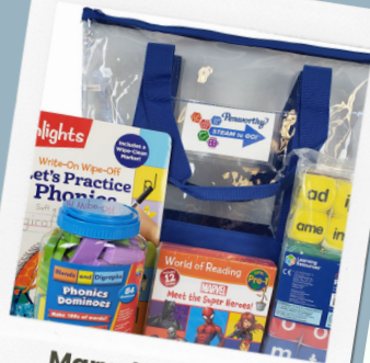
Marvel Phonics Kit